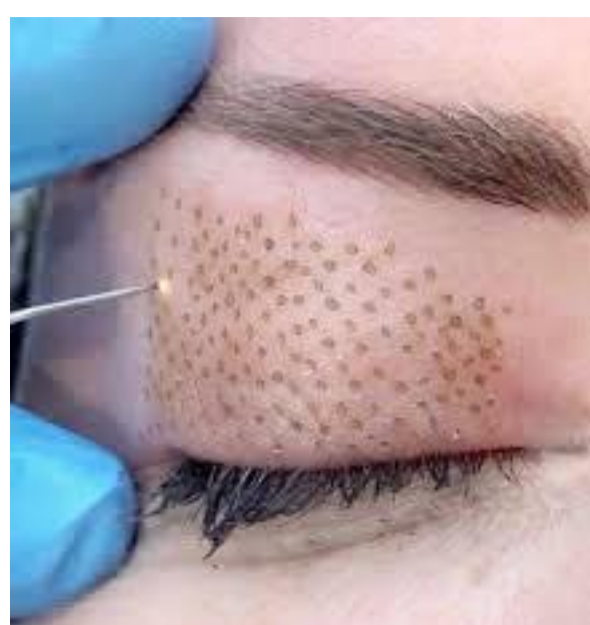
This photo shows a plasma pen treatment. Supplied photo

Health Canada is warning Canadians about the potential negative effects of a type of cosmetic device — some of which can likely be found in Orillia, according to a local medical esthetician.